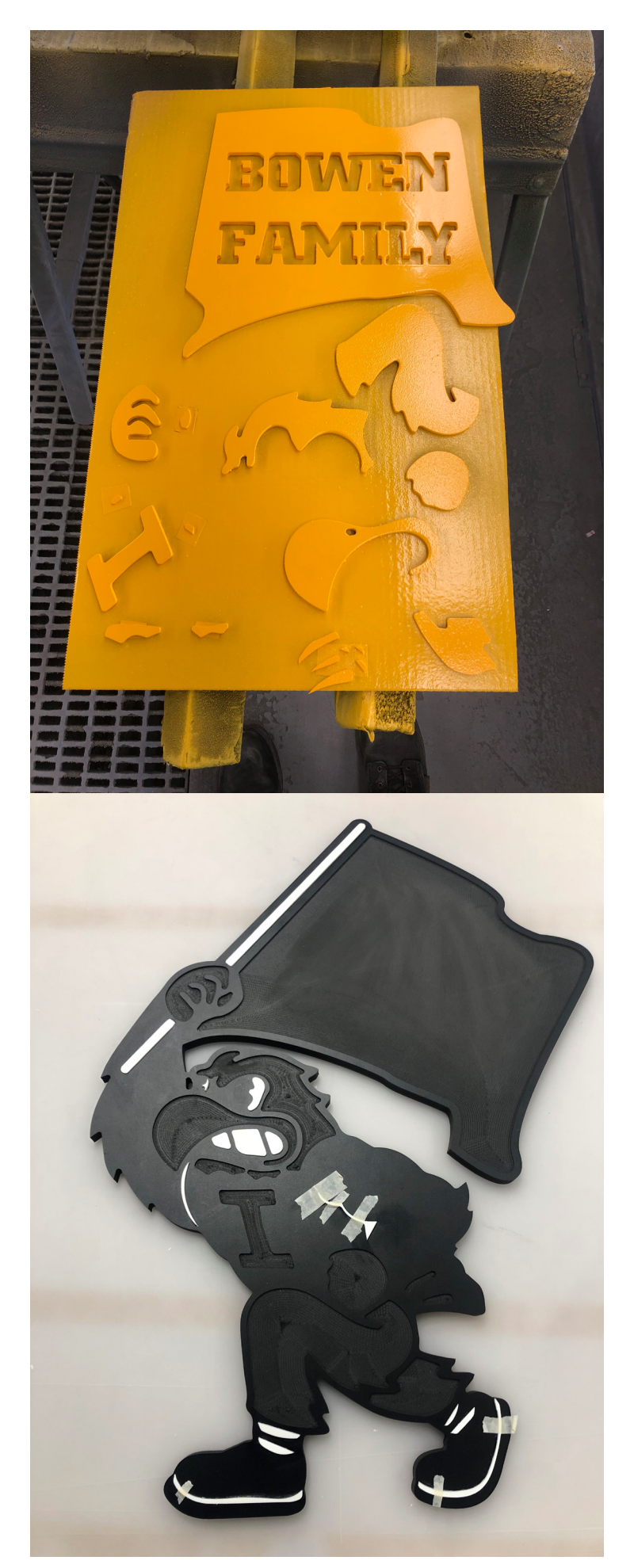
In Process of Painting and Glueing Pieces