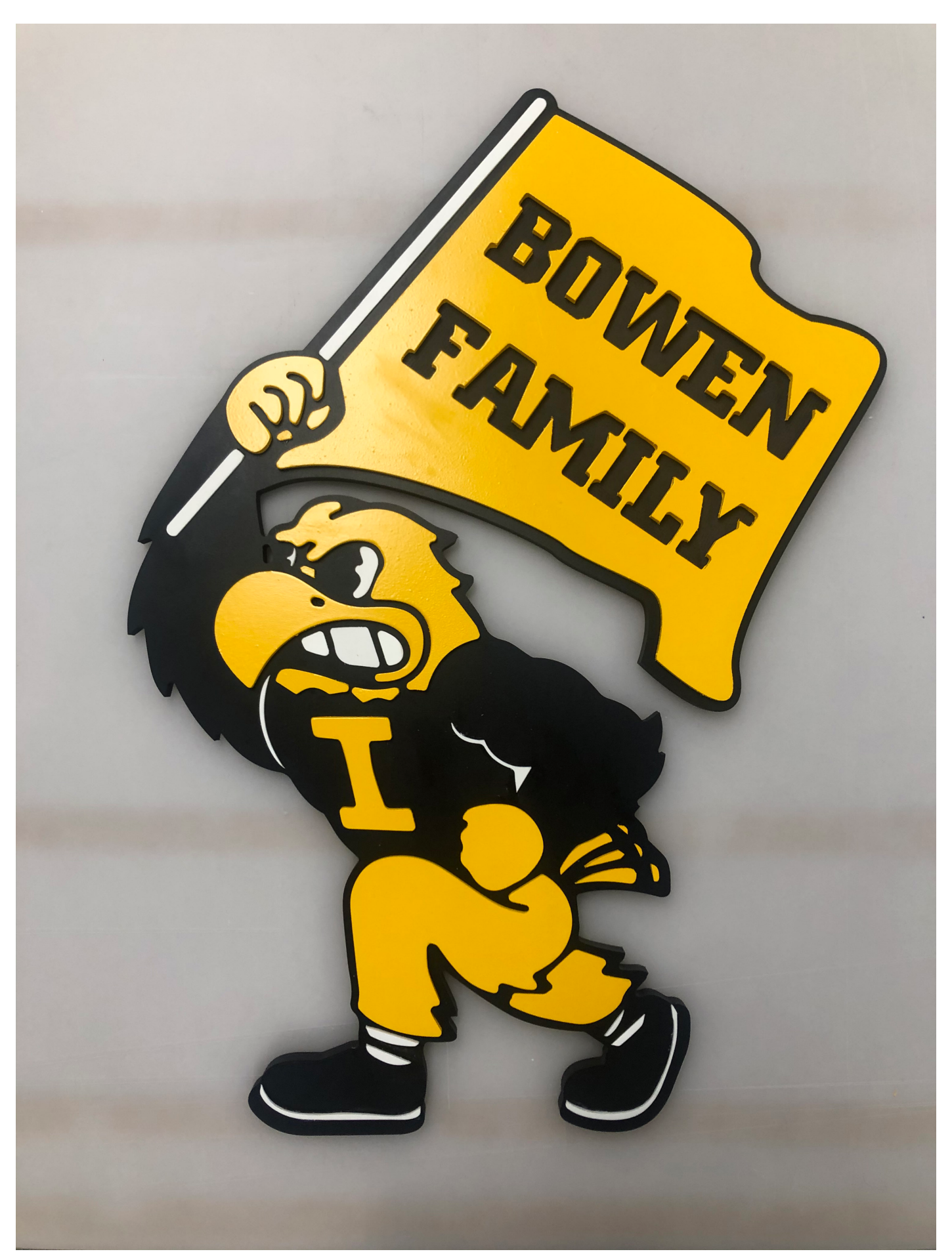
Final Sign Completed