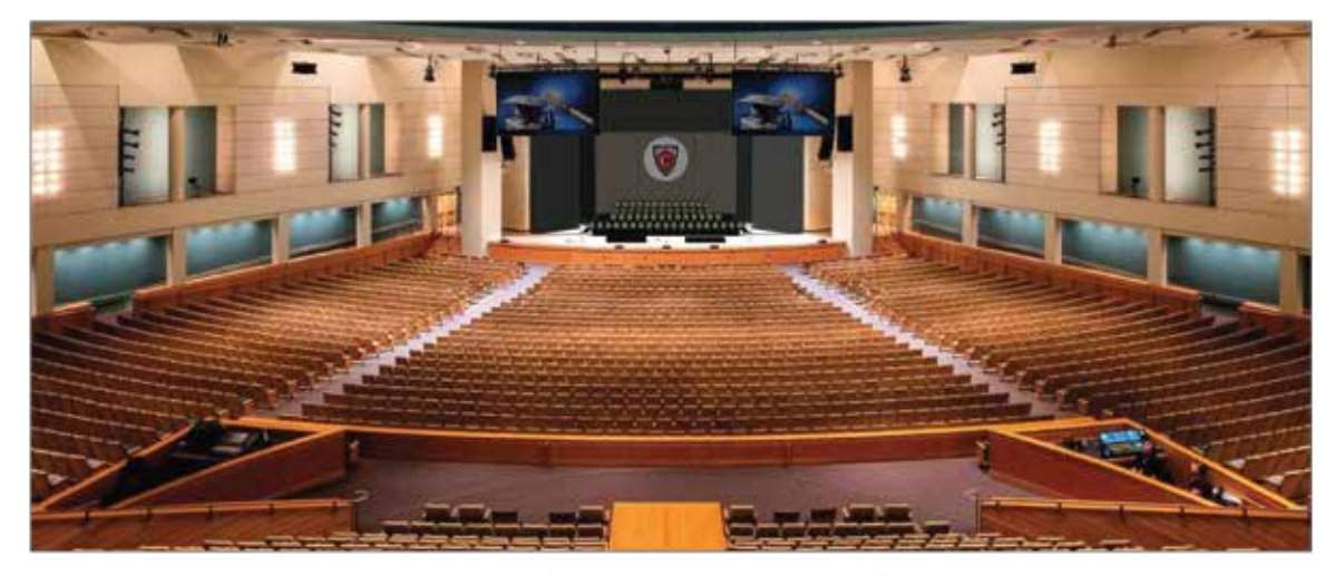
Client Was Looking for 8'x 8' Sign to Hang for Graduation

Cut 8' x 8' Sign Out of HDU Foam 2"Thick Attach Mounts to be Hung from Ceiling Hand Painted School Colors