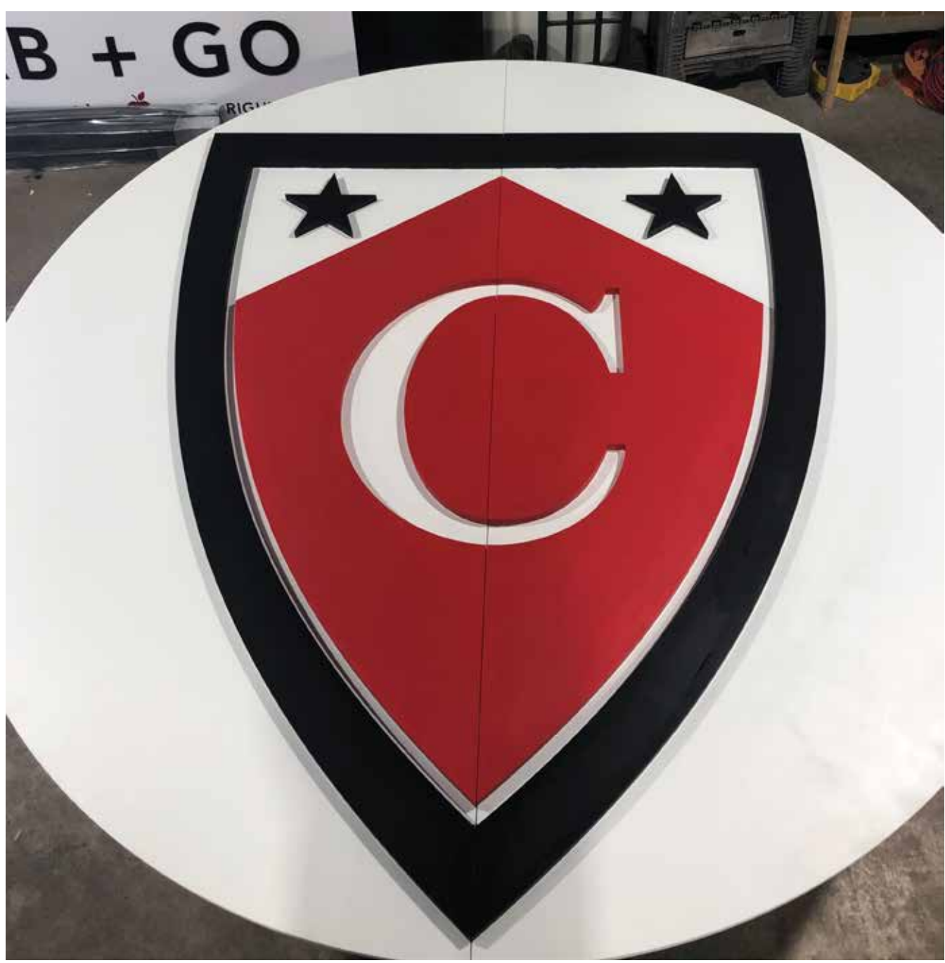
Final Hand Painted Sign