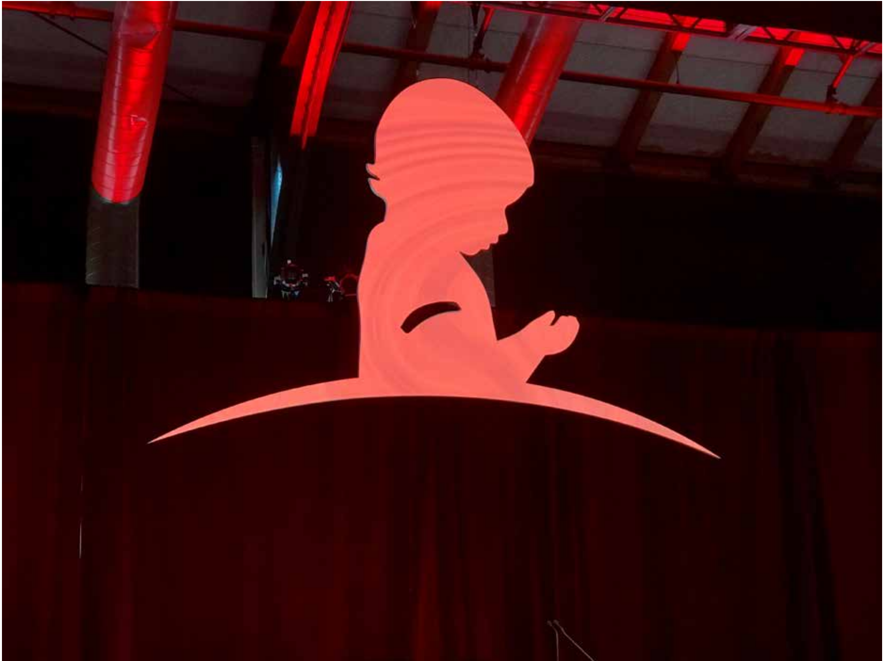
Finished Sign Installed at Event